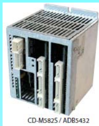
CD-M582S / ADB5432