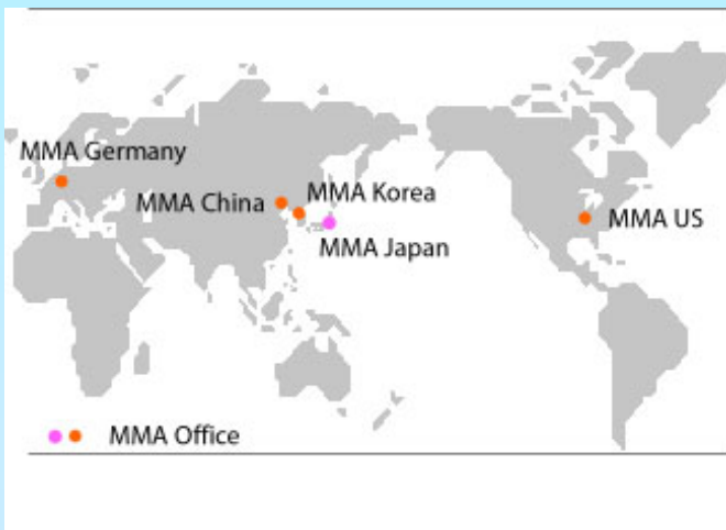
MMA Offices in the World

The establishment of MMA offices overseas will boost the activities of the MMA toward broader use of MECHATROLINK throughout the world, and help develop it into a global standard network, compliant with various kinds of standards.