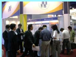
Motion Control Show

The exhibition was held in Las Vegas, Nevada (USA), Oct. 15 through 17. The MMA set up a MECHATROLINK exhibition section in the booth provided by YASKAWA ELECTRIC America. Among MMA members, RKC INSTRUMENT INC ., PHOENIX CONTACT, ORIENTAL MOTOR CO., Ltd., MYCOM,INC., and YASKAWA ELECTRIC CORPORATION, participated in the exhibition.