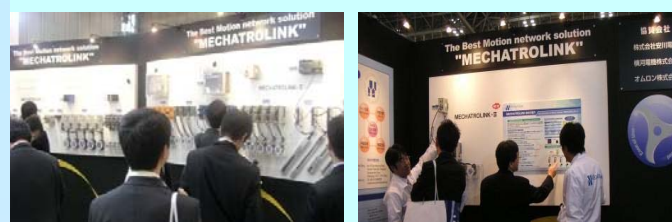
SEMICON Japan 2007