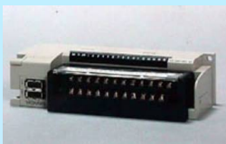
Model : JAMSC-IO2920-E Approx.Mass : 300g

I/O Channels : 8/8 Rated Voltage : 12/24 VDC Rated Current : Input : 2.5 mA / 5 mA Output : 0.3 A I/O Mode : Input : Combined sink / source mode Output : sink mode External Power Supply : 24 VDC (20.4 V to 28.8 V), 90 mA