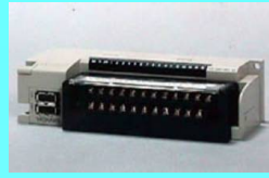
Model : JAMSC-IO2950-E Approx.Mass : 300g

Output Channels : 8 Rated Voltage : 12/24 VDC, 100/200 VAC Rated Current : 1.0 A Output Mode : Contact output External Power Supply : 24 VDC (20.4 V to 28.8 V), 50 mA