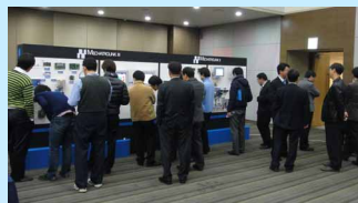
Display of products