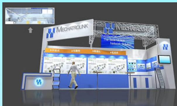
Planned design for MMA booth

Dates: Mar. 15 (Tue) – 17 (Thu), 2011 Place: Shanghai New International Expo Centre MMA Booth No.: W2-2146 URL: http://www.semiconchina.org/index.htm