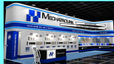
Planned design for MMA booth