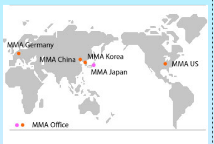
MMA Offices in the World

The establishment of MMA offices overseas will boost the activities of the MMA toward broader use of MECHATROLINK throughout the world, and help develop it into a global standard network, compliant with various kinds of standards.